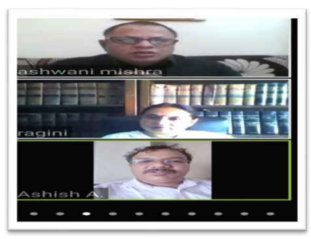
Webinar conducted on "Considerations and strategies for Drug regulatory and pharmacovigilance"