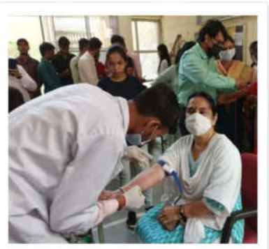
Health Camp organized by the Pharmacy Department with Collaboration with Pathkind (2022)